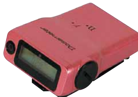
Gamma (X) and neutron