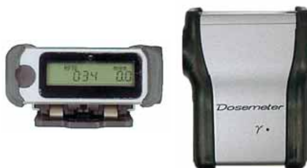
Gamma (X) , Magnesium alloy case