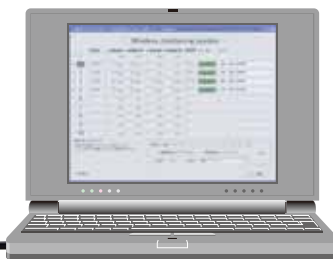
PC (Supply by the User)