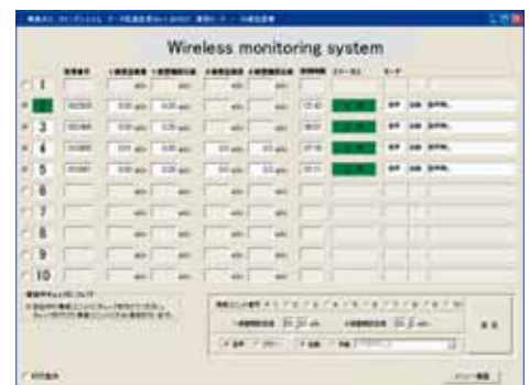
Example display screen of data processing unit