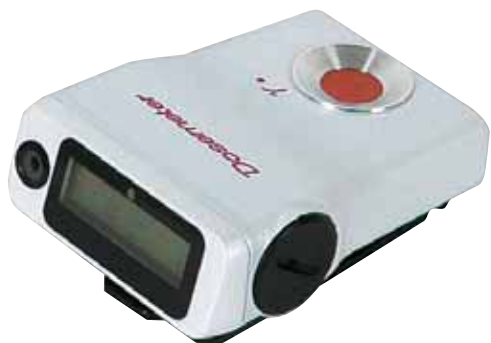
Gamma (X) and beta